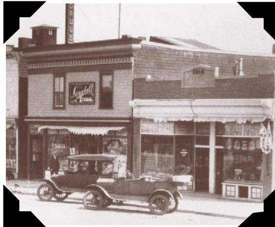
Langbell Studio and Precision Vacuum Building

E. Precision Vacuum – The building dates back to 1914 as a grocery store. In restoring the transom windows we discovered two panes of glass in each frame. The outer panes are clear glass and the inner panes are etched glass. Some of the etched panes were broken and have been replaced.