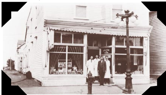
Candler Art Gallery

line, he rushed to the livery stable, mounted his steed and just as he came around the corner onto 50th Street the starter yelled, "Go!" Oscar spurred his pony but the animal stumbled at the 50th Avenue intersection and fell with the boy trapped underneath. According to a Camrose Canadian news item, men rushed from all sides to hold the pony, and lifted Oscar into an automobile and rushed him to the hospital. The lad had been killed instantly with a crushed skull.